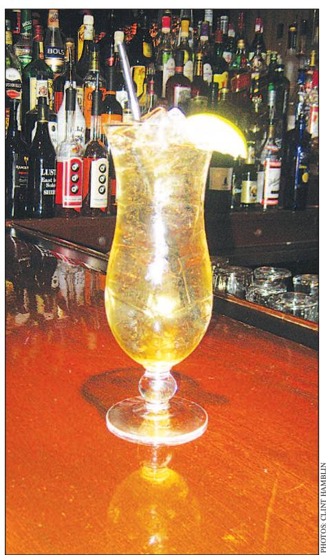
888 Icarus Cream Soda

Cover plate with hot tomato sauce, stack eggplant rolls, garnish with grilled summer squash, toasted pine nuts and basil purée.