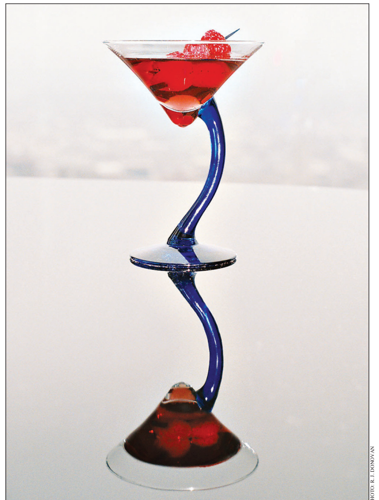
The Level 52

Pour Level Vodka and Chambord in a martini shaker with ice. Shake thoroughly to mix then chill well. Pour into a chilled martini glass and top with a splash of your favorite champagne. Garnish the chilled martini glass with raspberries and a lime wedge or curl.