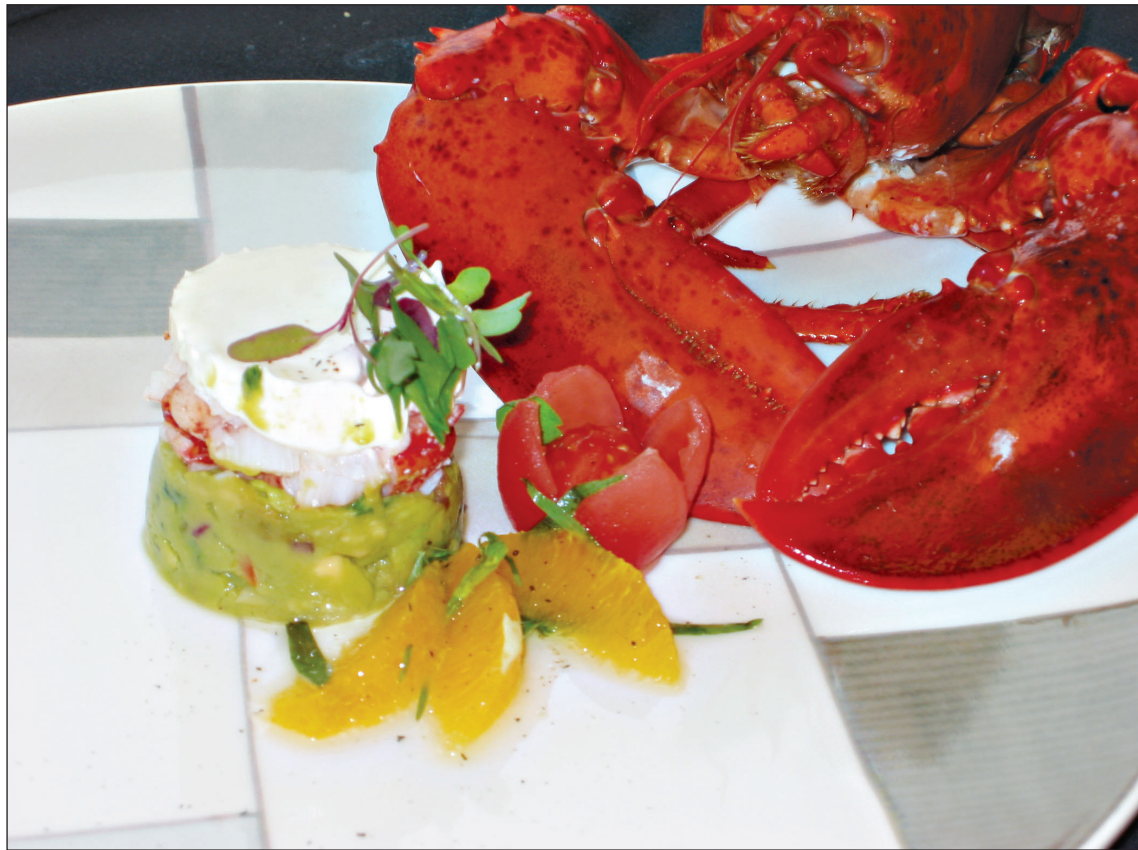
Avocado and Lobster Salad

The Spice Rubbed Rare Tuna is served with Soybean Purée and Miso Truffled Butter, and the