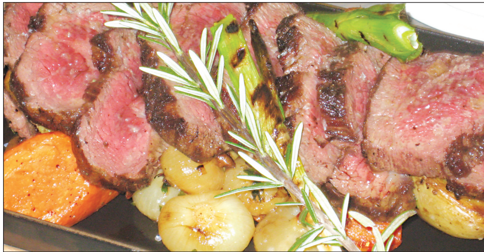
Chateaubriand for Two

The tenderloin is sliced into small steaks and surrounded by the potato and carrot mixture, but be forewarned: This simple to make dish is truly dependent upon the