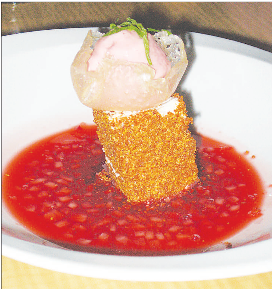
Strawberry soup from Sensing